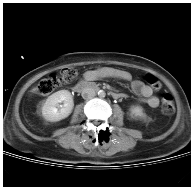
Figure 2. CT scan of the abdomen and pelvis, with oral and intravenous contrast showing multifoci of air bubbles in back muscles beside the vertebra (arrows).